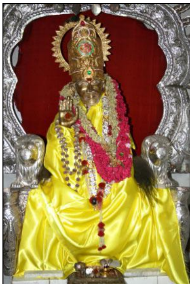
Idol of Sri Samartha Sadguru Darbar Sainath at Dargas