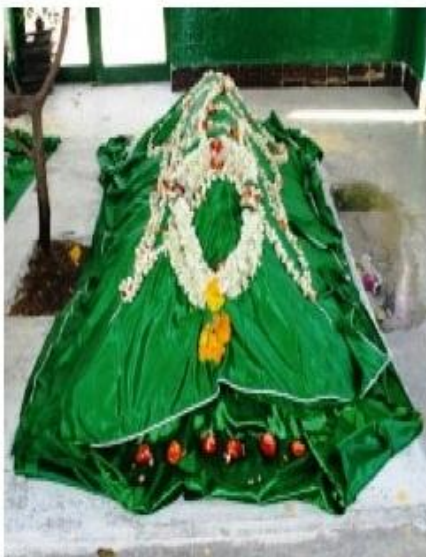
Tomb of Sadguru Jaleel Mastanvali